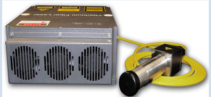
Figure 1: Standard YLP Series Laser