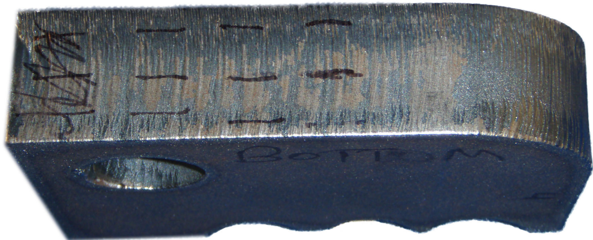
Figure 2: 16 mm Fiber Laser Cut Mild Steel

+1 (508) 373-1100 sales.us@ipgphotonics.com