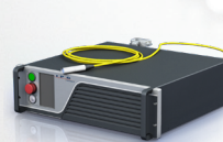
YLR-1000 Single Mode