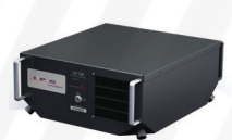
LDD-700 Inline Process Monitor