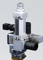
D50 Wobble/Welding Heads