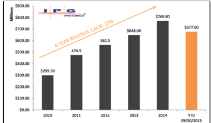
IPG Photonics sales growth.

The fundamental reason is easy to understand: fiber lasers offer their users a production laser at the lowest price per watt, with the highest beam quality, the lowest electrical consumption and minimum maintenance. These lightweight compact lasers can be installed in a matter of a few hours