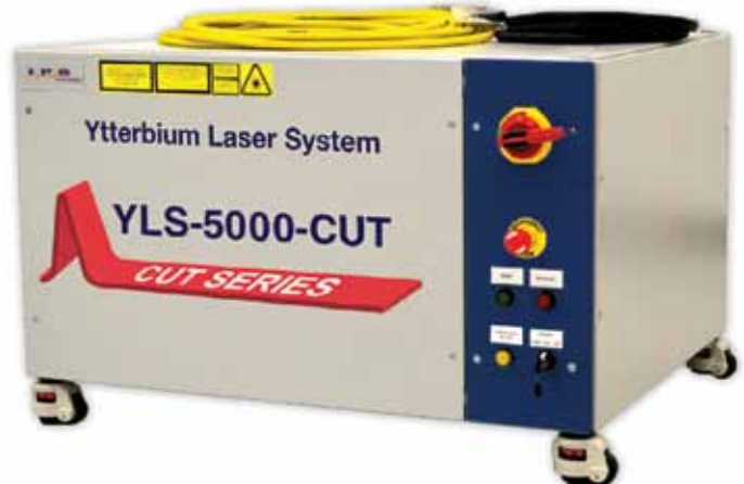
6kW fiber laser machines have become more common