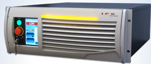
Figure 1: Quasi-Continuous Wave High Pulse Energy Fiber Laser