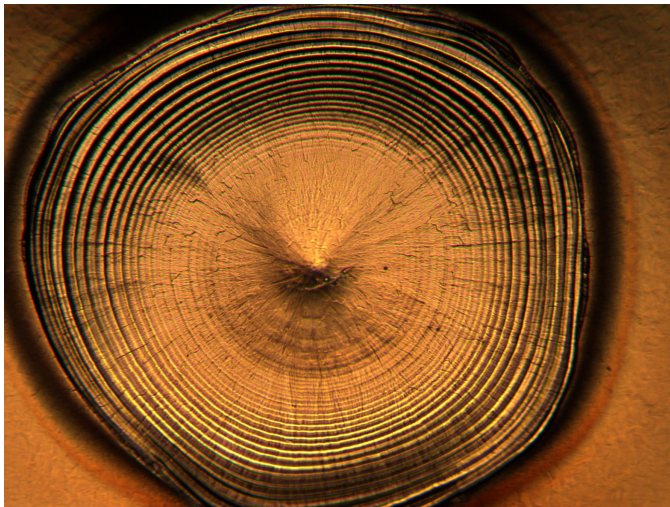
Figure 3a: Standard 10 ms Pulse

This pulse shaping capability is essential for micro-welding techniques such as dissimilar metal welding and welding of high reflectivity metals; a demonstration of the effect of two temporal pulse shapes is shown in Figures 3a & 3b (Below.) Solidification conditions are modified by this temporal pulse shaping and individual pulses can be finely tuned for each weld application.