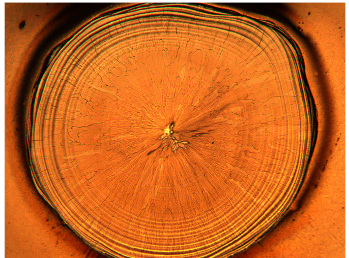
Figure 3b: 10 ms Eglise Pulse Shape with 8 ms Tail

IPG looks forward to helping our customers with their laser applications and future plans. A laser solution should evaluate all project aspects including feasibility, productivity, metallurgy and part fixturing before a laser type and optical configuration is selected. Contact IPG's applications facilities for expert sample evaluation or process development.